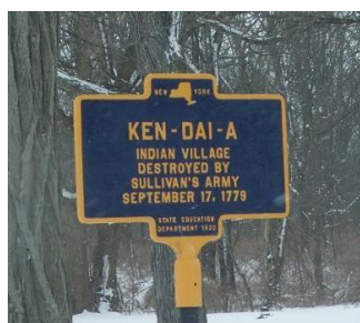
Historical marker at the location of Kendaia, a Native American archaeological site located within the park.

Long before Europeans arrived on the continent, Native Americans were living and traveling by way of footpaths throughout the Finger Lakes and along the shores of Lake Ontario. For more than 10,000 years, prehistoric people made settlements, grew agricultural crops, hunted, and fished in the Finger Lakes region, with the Iroquois Nation the last of a series of Indian cultures to have lived here.