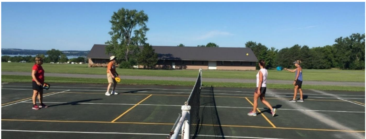
Pickleball at Sampson