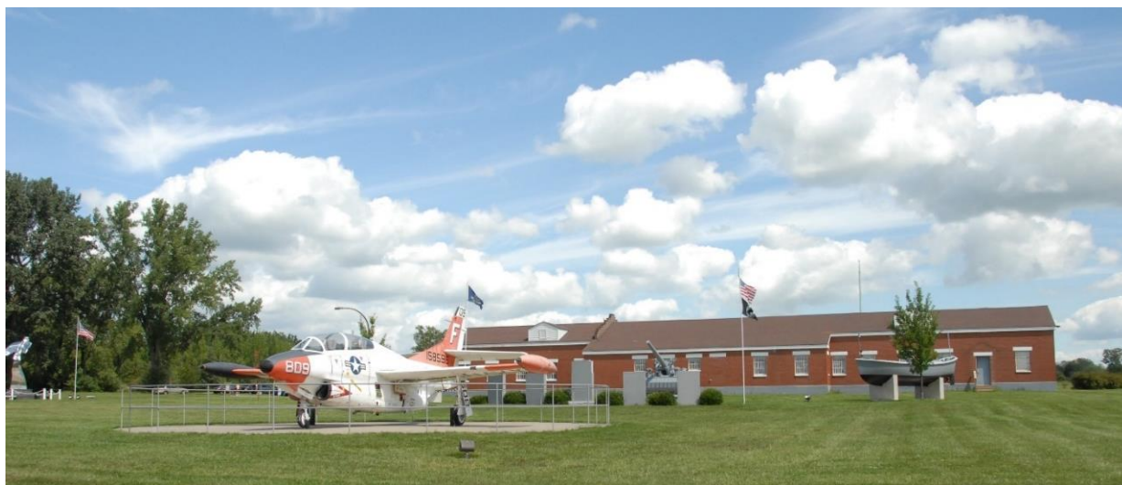
Sampson Memorial Naval and Air Force Museum

This action will allow the park to offer a more complete picture of the site's military history. There is strong interest in this type of content, and it may help attract new visitors to the park.