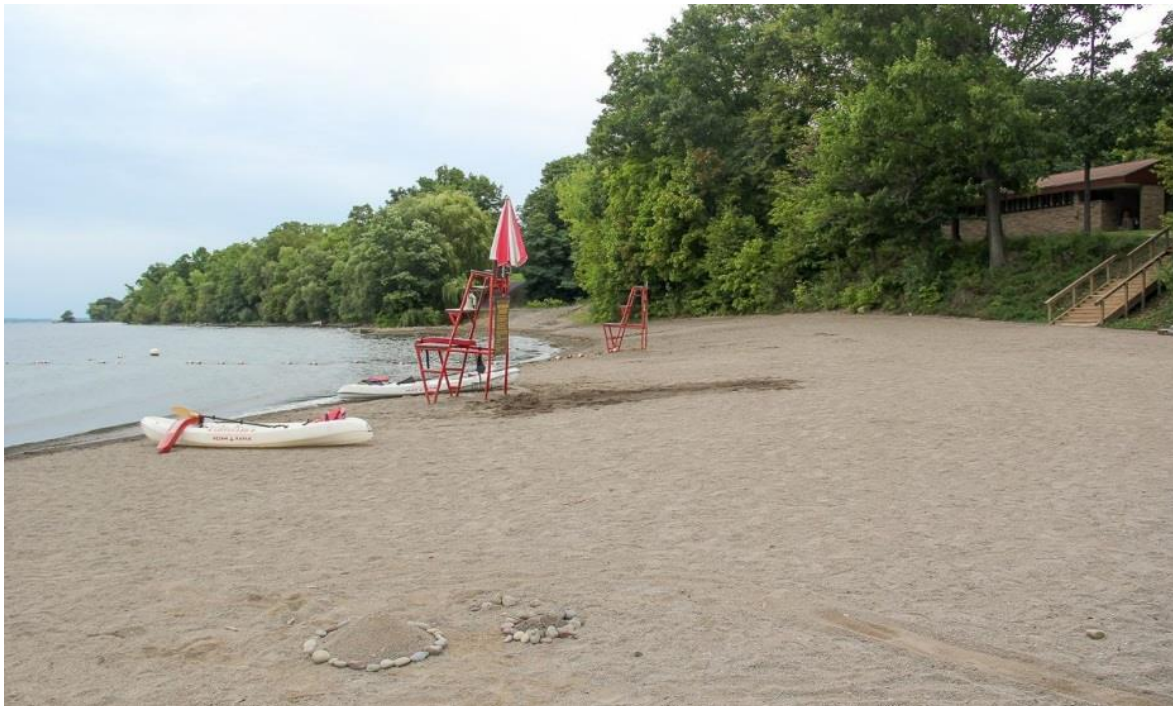
Sampson SP beachfront on Seneca Lake

The implementation of the balance of the action items in the master plan for the Park will be divided into priority phases. These elements are subject to reorganization based on available funding for specific components in the Master Plan.